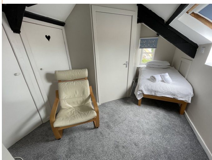
Upstairs single bed in twin room