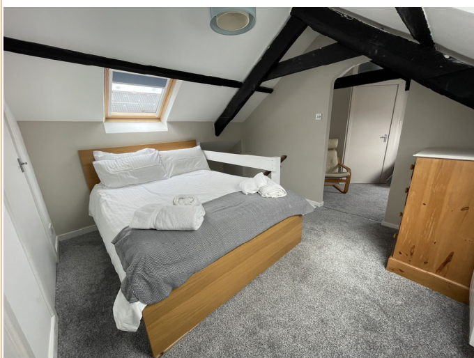
Upstairs double bed in twin room