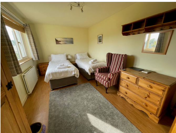
Upstairs twin bedroom