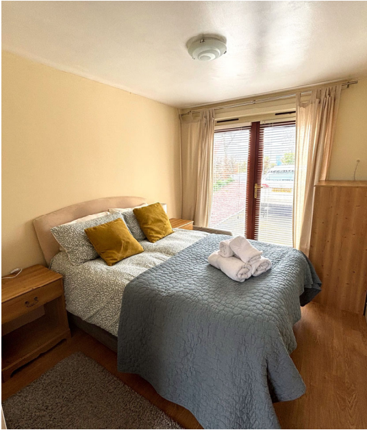
Downstairs double bedroom