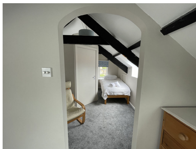
Upstairs single bed in twin room