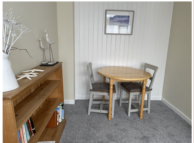
Downstairs lounge study area