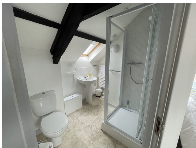
Upstairs en suite facilities