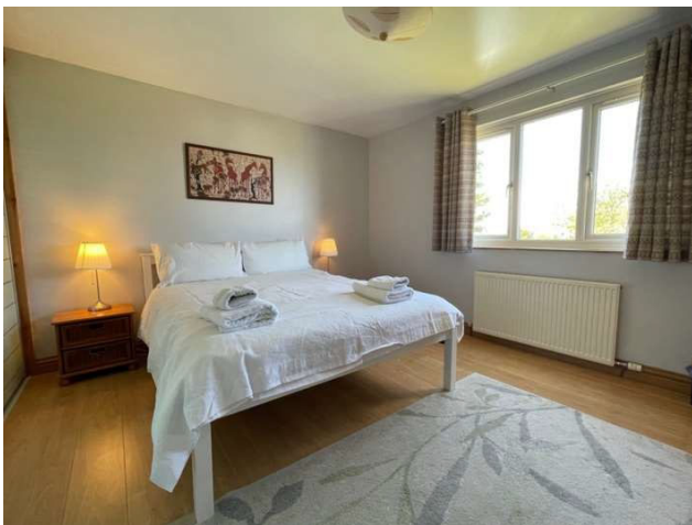
Upstairs master bedroom with king-sized bed