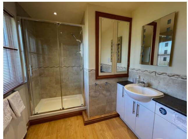
Master ensuite shower room