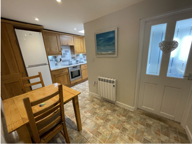
Downstairs kitchen dining area