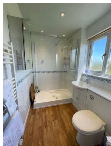
Ensuite shower room