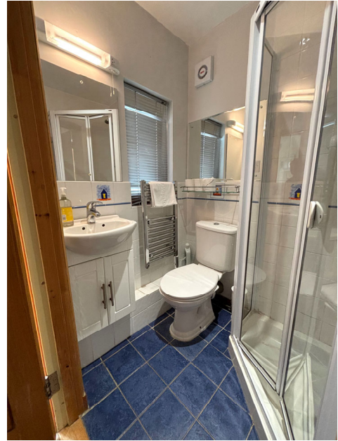
Downstairs shower room